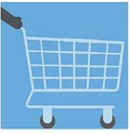
SHOP AT NON-PEAK HOURS