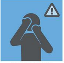
AVOID TOUCHING YOUR EYES, NOSE, OR MOUTH WITH UNWASHED HANDS OR AFTER TOUCHING SURFACES