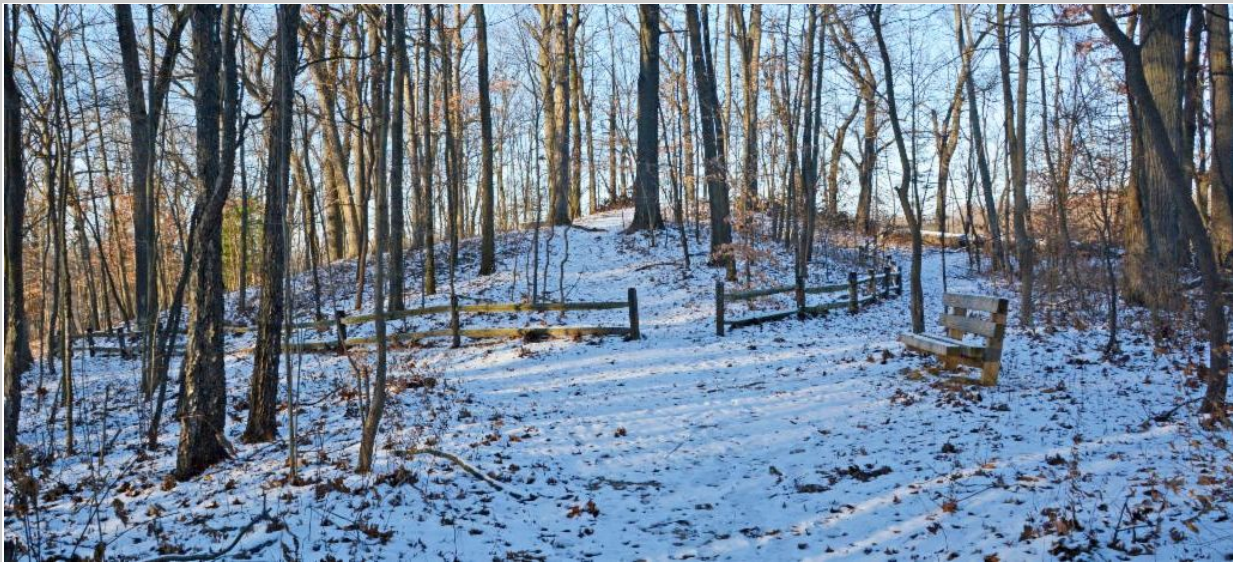
Towner's Woods, photo credit: Denny Reiser