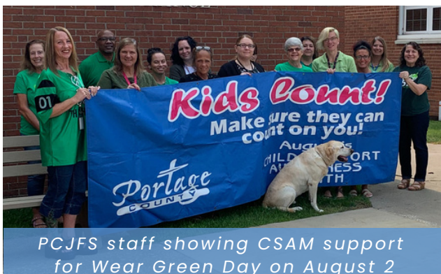
PCJFS staff showing CSAM support for Wear Green Day on August 2

Some of the CSAM activities included a social media awareness campaign and "Wear Green Day." Additionally, appreciation snack baskets, tote bags, and certificates were presented to all Portage County CSEA staff and community partners in the Portage County Domestic Relations